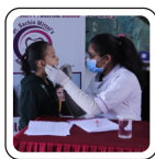
Life Cycle of Medicine & Vaccine