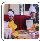
Culinary Skills & Baking